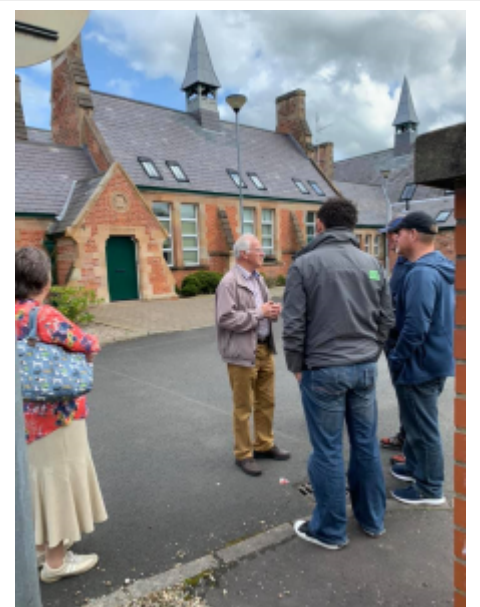
Outside the Irish Society Primary School, Coleraine

In the Hebridean revival it is believed that 75% of those who were saved were converted outside of