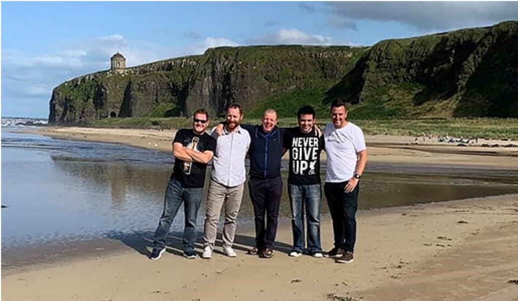
5 lead pastors on Downhill Beach

[The next Four12 European Conference is July 7-9 July 2020 on the Isle of Man. We're considering an 1859 Ulster Revival two-day study and prayer visit to Northern Ireland also around that time. Contact jonathan.stanfield@livinghope.im for